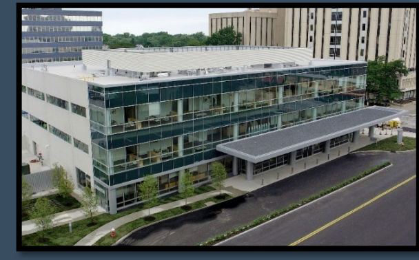
Lakewood Family Health Center